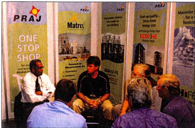
pro/M/tec Theisen GmbH

raw materials right from cane molasses to grains and tubers like cassava and now sweet sorghum. Praj provides holistic solutions encompassing range of technologies and systems for wastewater management, which makes its solutions unique.